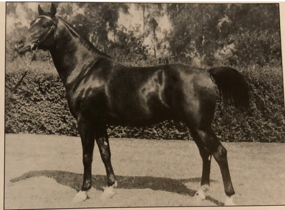
The great *Witez II, a Polish-bred Arabian stallion, was a prominent stud in the German Remount breeding program during World War II. *Witez II was brought to the United States, where, after the dissolution of the Remount Program, he became a major influence in Arabian horse breeding.